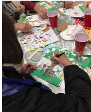
Hearts for Haiti Love Notes made with pictures children from Caracol have drawn.

Military Street Baptist Church Sunday School shows their love by making Valentines for the girls at Strong Tower. Their weekly Sunday School collection goes to help sponsor our girls.