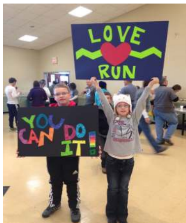
Love Walk/Run Maine & Missouri